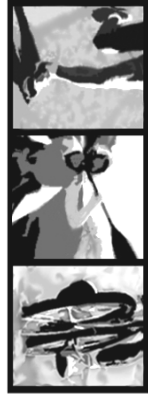
Great Greenbrier River Race

Maps and other literature may be picked up at the Pocahontas County Convention and Visitors Bureau located at 708 Second Avenue, across from the Town Fire Dept.